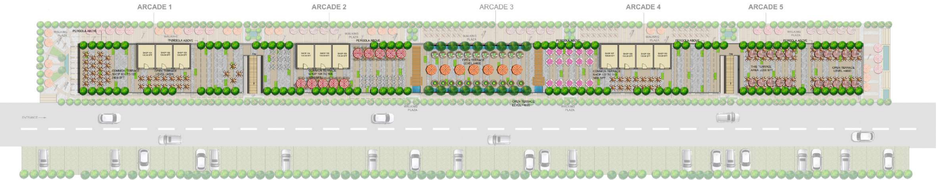
MAP NOT TO SCALE FOR INFORMATIVE PURPOSE ONLY