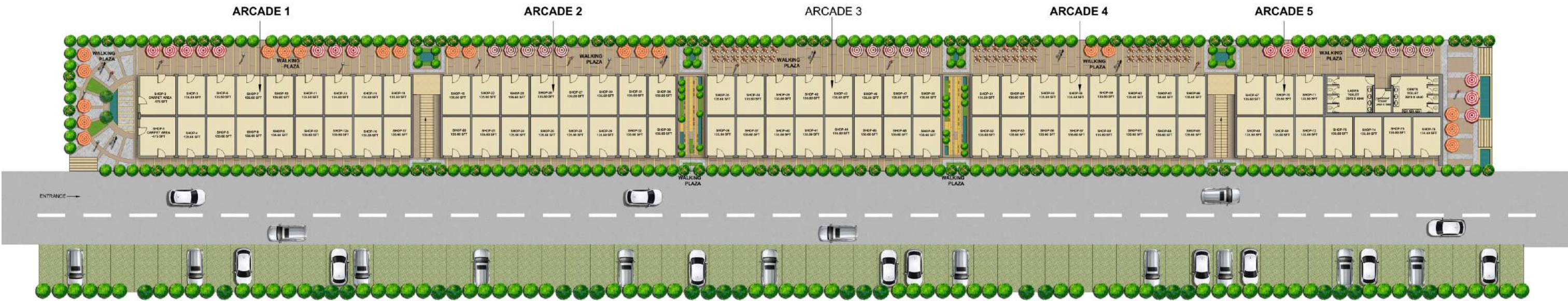
MAP NOT TO SCALE FOR INFORMATIVE PURPOSE ONLY